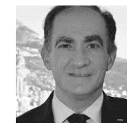
Jean CASTELLINI, Minister of Finance and Economy Principality of Monaco