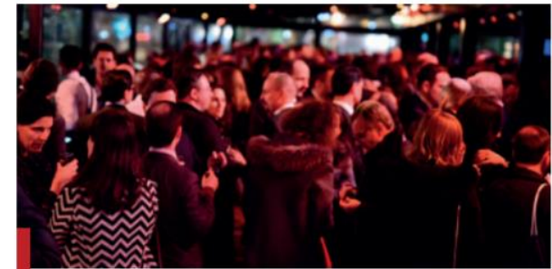
30+ social and networking events