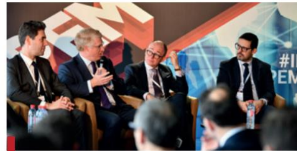
50+ panels, keynotes and summits