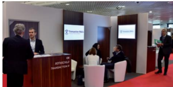
190+ stands and 3 lounges to hold your meetings