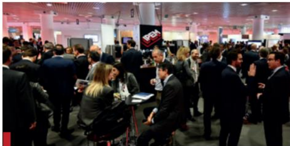
2,400+ delegates from 40 countries

> Everyone that matters in European private markets