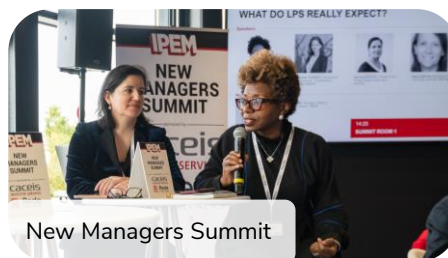
New Managers Summit

ASKING THE ALLOCATORS THE SUSTAINABILITY AND IMPACT REPORT