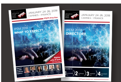
PREVIEW & DIRECTORY