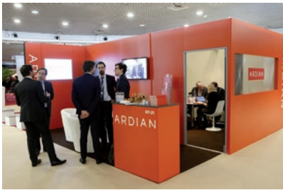
HOSPITALITY SUITE (25sqm)

Relocate your office in Cannes, center of the PE & VC industry for 3 days