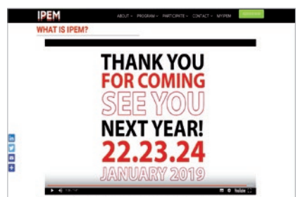
WEBSITE & NEWSLETTERS