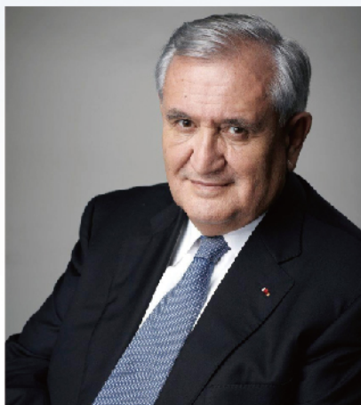
Jean-Pierre Raffarin 拉法兰先生 Former Prime Minister of France 法国前总理 Chairman of FPI FPI 主席

As Chair of IPEM China 2024, I am honored to welcome the delegation of European companies to China, where we will engage with Chinese national and regional governments, global investors, and private-sector partners. This year, we also celebrate an important milestone: the 60th anniversary of diplomatic relations between France and China. Our mission is to explore pathways for investment and business growth in one of the world's most dynamic economies. This gathering unites global investors and entrepreneurs eager to exchange insights and strategies, fostering exceptional opportunities.