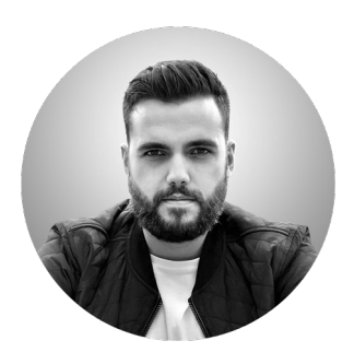
For any additional questions, please contact: